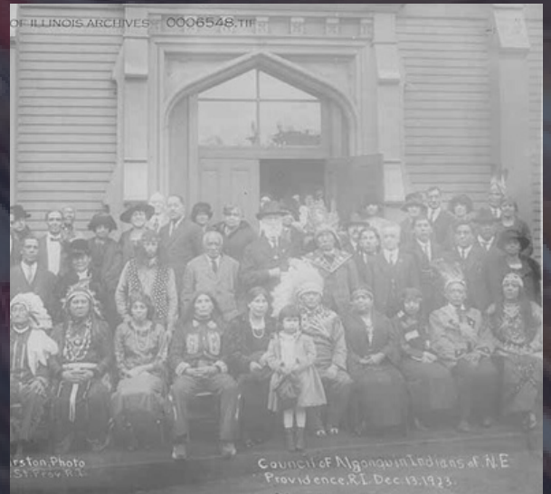
Founding Meeting of the National Algonquin Indians Council in Providence, RI in 1923.

Perhaps the most famous modern descendent of the Pokanoket royal line was Princess Red Wing of the Seven Crescents , born Mary Glasko in Sprague, CT, in 1896. Her life and work embody great historical significance for the Pokanoket and Narragansett nations, as she was a strong advocate for the visibility of New England tribes. Founder of the Tomaquag Indian Memorial Museum, Princess Red Wing was also inducted into the Rhode Island Heritage Hall of Fame, received an honorary doctorate from the University of Rhode Island, and in 1946 she became the first Native American to address the United Nations.