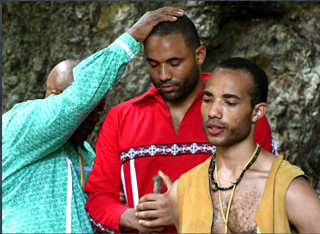
Walk of the Pineese Ceremony at Potumtuk