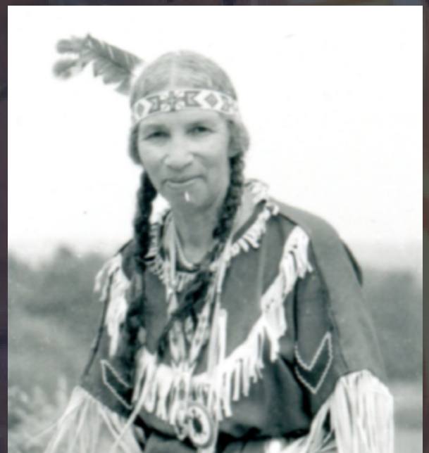
Princess Red Wing, noted Indigenous leader in Rhode Island (ca. 1960).