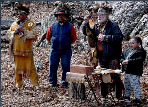
2019 Renewal of the Covenant ceremony led by the Sagamore